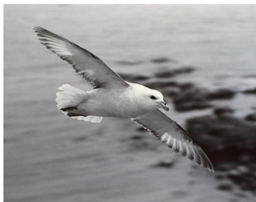
Three photographs by D M Turner (Tyneside Cinema; Gallery Screen; Northern Fulmar in flight at Marsden Bay, 2 July 1977)